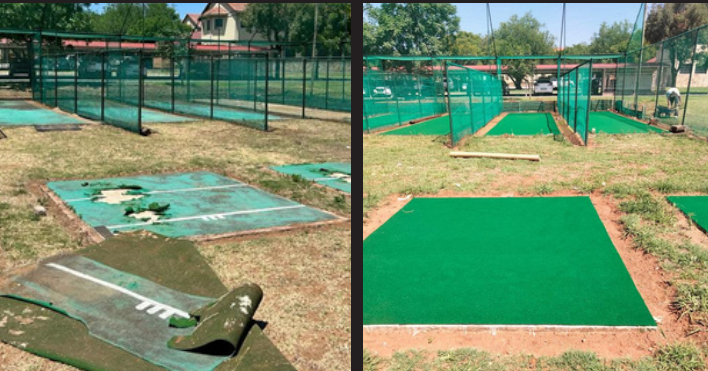
Fields College Cricket