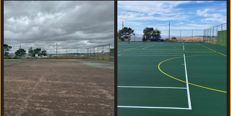
Walter Sisulu University ZMK Campus