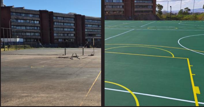
Walter Sisulu University NMD Campus